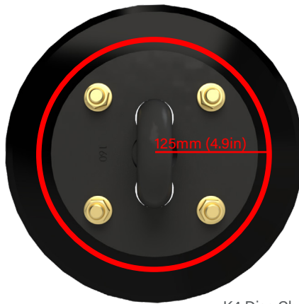
K4 Disc Chain