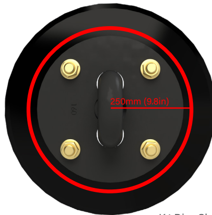
K4 Disc Chain