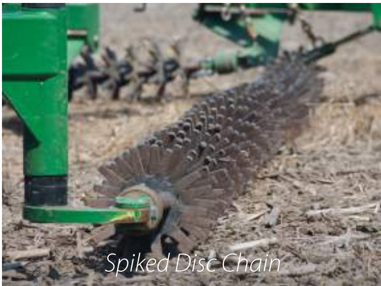
Spiked Disc Chain