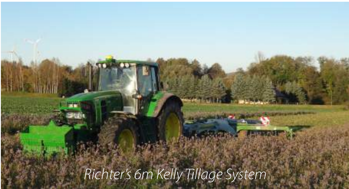
Richter's 6m Kelly Tillage System