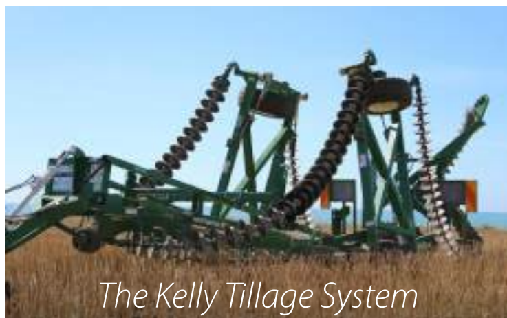
The Kelly Tillage System

‘Sustainable agriculture’ may feel like an overused buzzword, but improving soil health now and for future generations is something that’s at the forefront of every farmer’s mind. Combating herbicide resistance and soil erosion, increasing moisture retention and reducing leaching of nitrates/fertilisers are all challenges that need to be overcome. With this in mind, we talked to German farmer Bernd Richter about the role that sustainability plays on his farm.