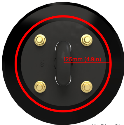
K4 Disc Chain